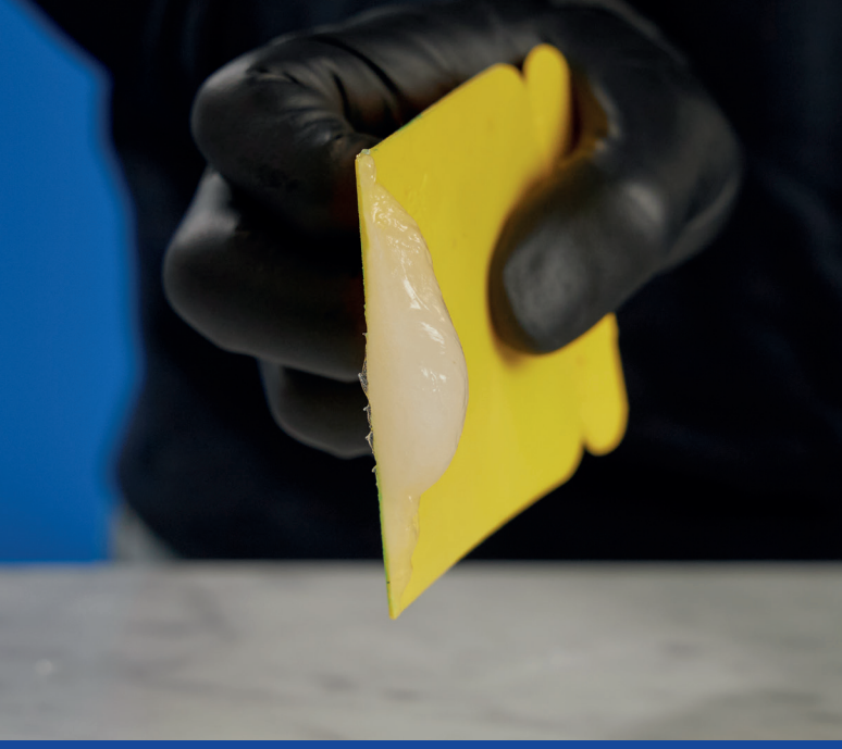
Mixing Post mix verticality