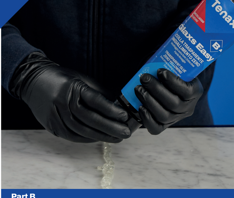
Part A Part B