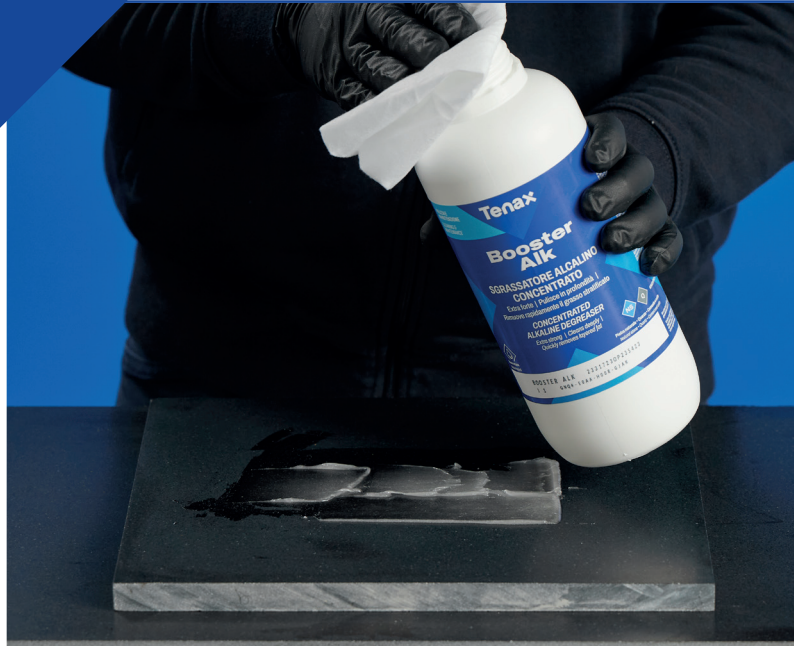
Dampen cloth and/or sponge