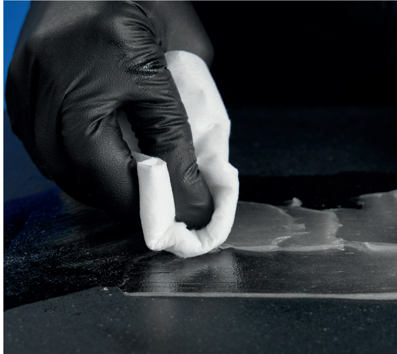
Clean the stain