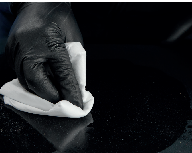
Rinse with water