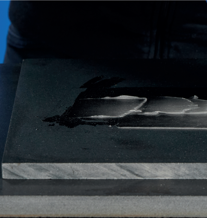
Leave on for a few moments